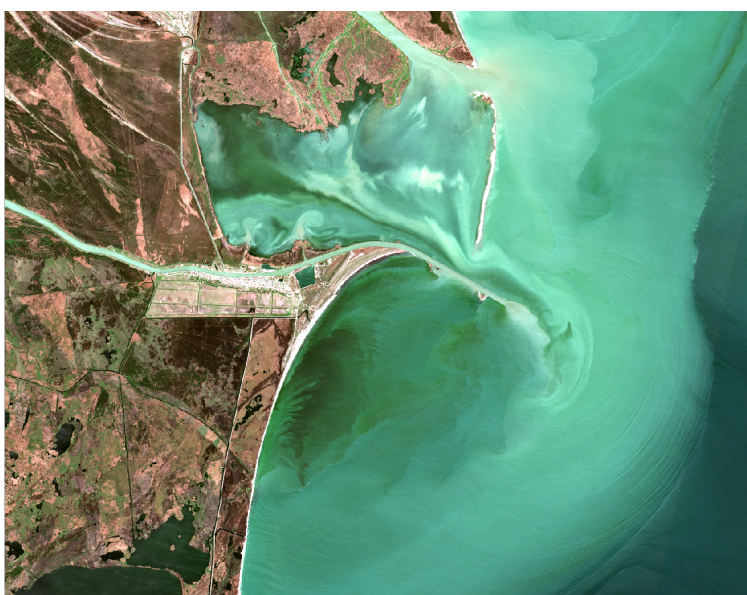
The Sulina anticyclonic current seen from the Sentinel 2 satellite.

CERTO is progressing water quality monitoring by offering near-real-time and on-request data through its portal. It meets the immediate needs of researchers and stakeholders while enriching the pool of assessment tools with new indicators for more accurate and precise evaluations. CERTO contributes to scientific inquiry through shared insights in publications, continually informing and enhancing practices in water quality monitoring.